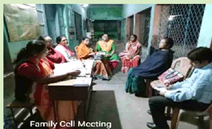
Family Cell Meeting

shared their activities, experiences and success stories which were remarkable on November 24, 2022. There are two such instances where members shared that a family was at the breaking point but with the help of family cell members that family could