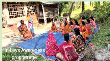
In-laws Awareness programme